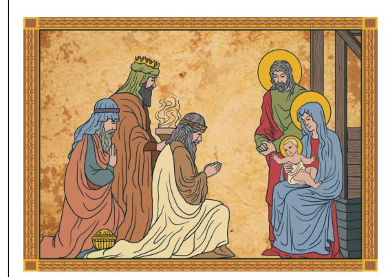
In Ireland, Epiphany is also sometimes called "Nollaig na mBean" or Women's Christmas.

Traditionally the women get the day off and men do the housework and cooking! It is becoming more popular and many Irish Women now get together on the Sunday nearest the Epiphany and have tea and cakes!